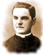
Father M. McGivney Founder KofC

As a Knight you can choose the projects with which you wish to be involved. Since our council is involved in so many activities throughout the year, you are sure to find one or more programs that are right for your interests and available time. More over, the Order is dedicated to family life and the many benefits it offers. From insurance to scholarships to service and social activities and programs, all are open to the whole family. As a Knight you can continue doing what you do now and you and your family can enjoy the many benefits the Order offers. For more information, please stop and ask any Knight in the Parish or call and speak with any of the names in this brochure.