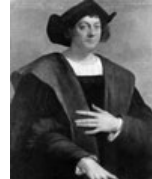
Christopher Columbus Namesake